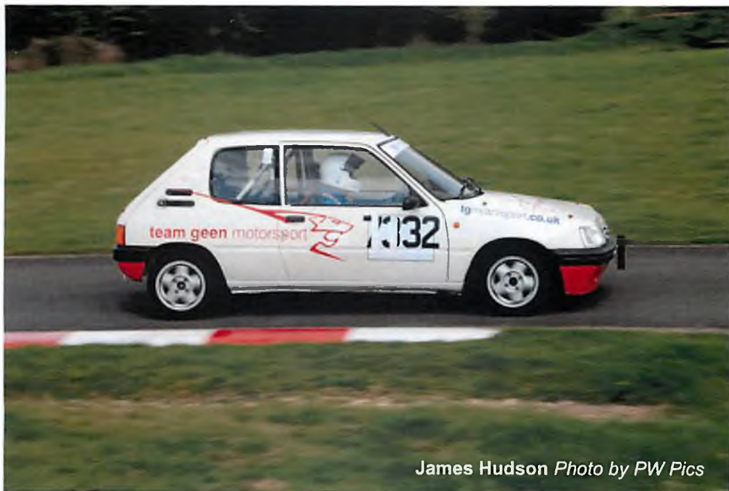
James Hudson

KEY: H = Harewood Speed Hillclimb Championship T (after engine capacity) = turbocharged S (after engine capacity) = supercharged