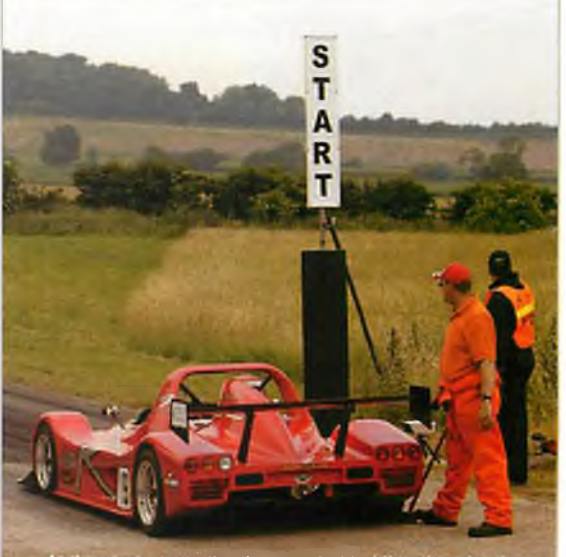
At the start – note the the marshal holding the wheel chock to stop the car rotling back

The ultimate achievement at each event is to establish the Fastest Time of the Day (FTD). This is usually claimed by one of the single seater racing cars, although wet weather can sometimes throw up an occasional surprise!