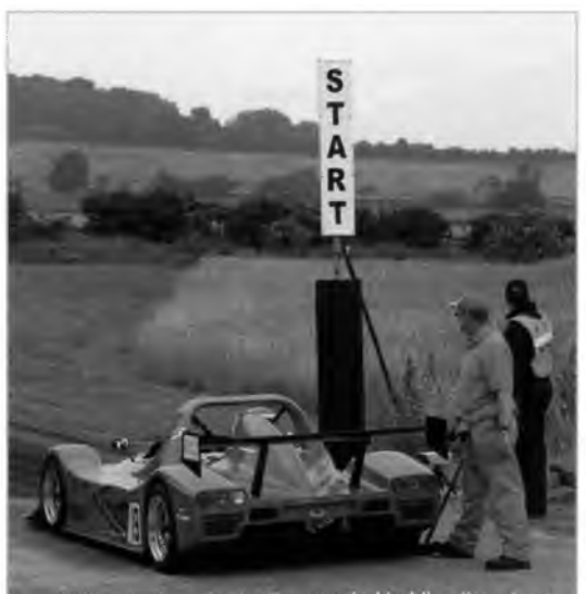
At the start – note the the marshal holding the wheel chock to stop the car rolling back

The ultimate achievement at each event is to establish the Fastest Time of the Day (FTD). This is usually claimed by one of the single seater racing cars, although wet weather can sometimes throw up an occasional surprise!